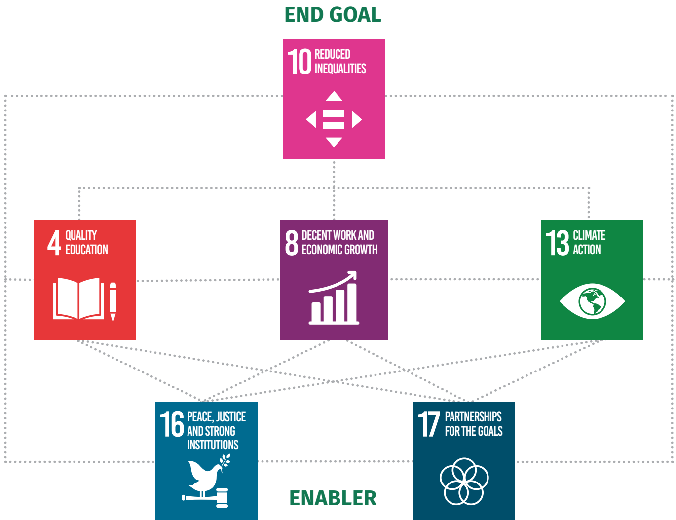
Figure 2: Interlinkages between 6 goals in the 2019 VNRs